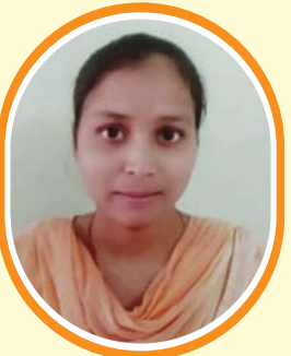
MONIKA B.Com (R) IBM Summer Training