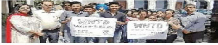
श्री के दौरान उपस्थित विद्यार्थी व स्कुल स्टाफ • जयपुर

को तंबाकू आदि के सेवन से बचने के लिए समय-समय पर प्रेरित करना चाहिए ताकि देश का भविष्य कष्टाने वाला युवा तंबाकू के नशे से बच सके। इसके दुष्प्रभाव के बारे में भी उनको बताना चाहिए। हर साल 9 लाख लोग सिगरेट के धुएँ को अंदर लेने की वजह से मौत के मुह में चले जाते हैं।